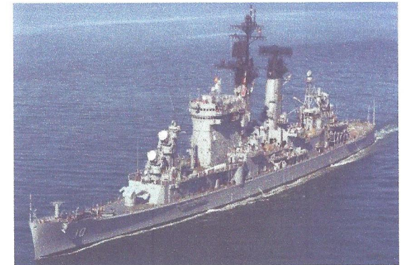
USS ALBANY CG-10

T he USS Albany Association was formed on September 1, 1990 in the capital city of Albany, New York, namesake of all the ships named Albany. The association is a non-profit veterans organization and is comprised of Navy and Marine veterans who served or are currently serving on board those ships bearing the name USS Albany.