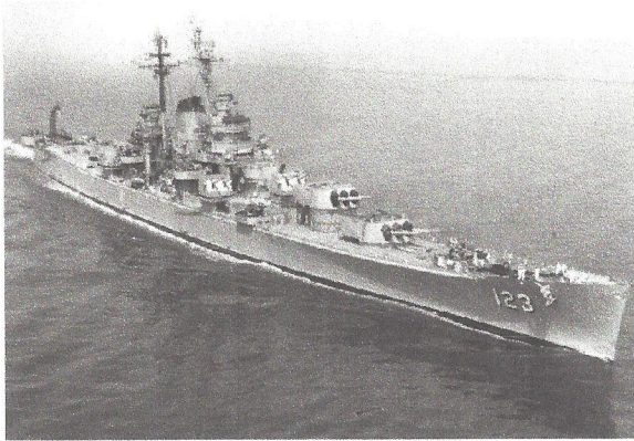
USS ALBANY CA-123